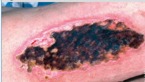
Leg wound with necrotic tissue